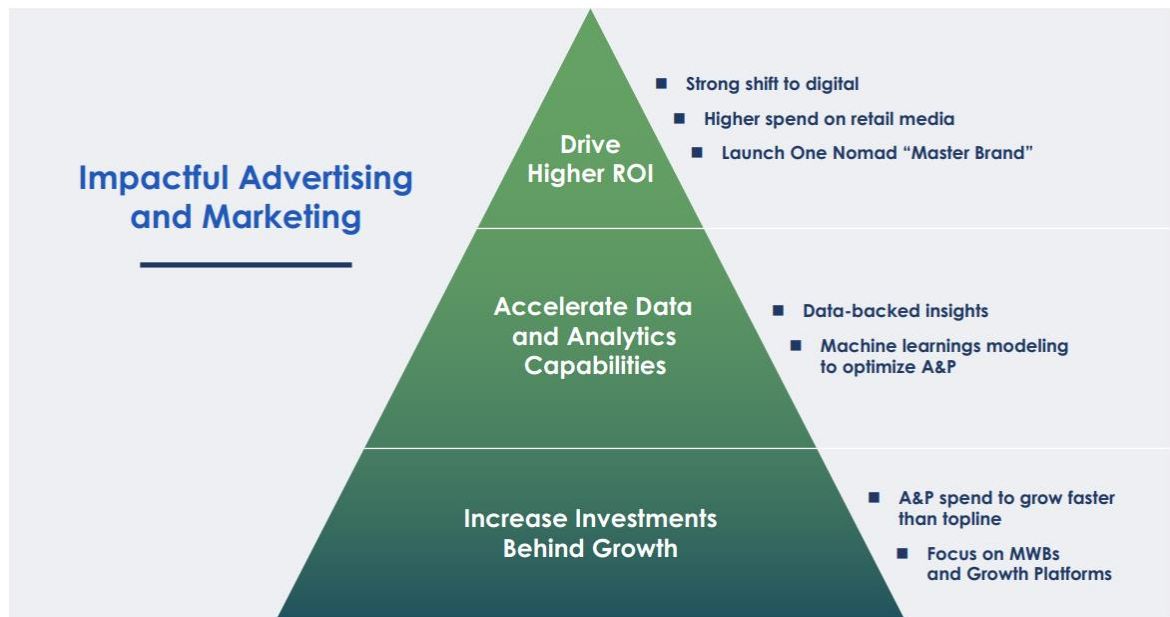
Source: Nomad Foods, CAGNY 2024 presentation.